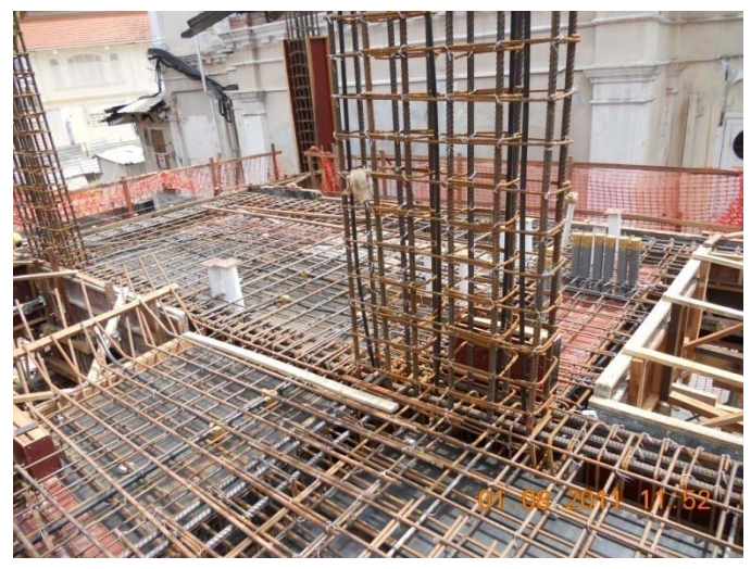
Re-bar checking and casting of slab @ 1st storey Slab @ grid line 6A-10C