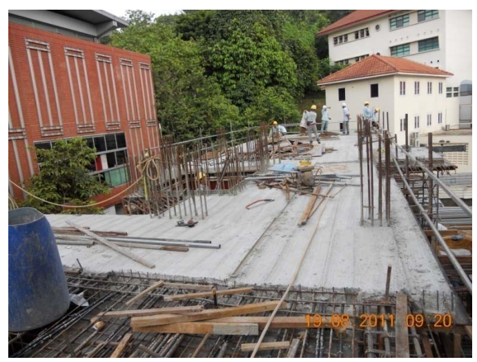
Re-bar Checking before casting of 2<sup>nd</sup> storey slab and after casting