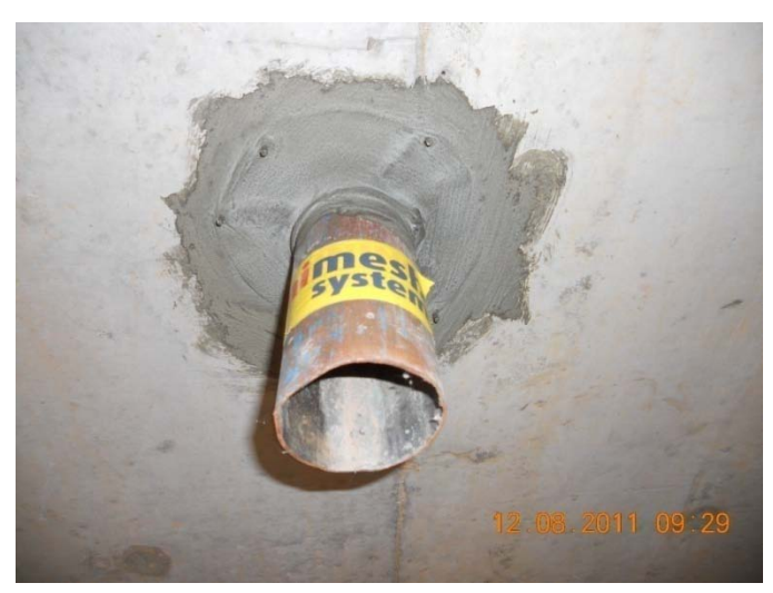
anti termite works before brick laying @ basement Floor