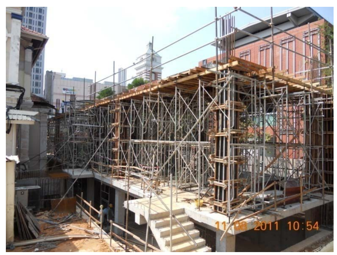
erection of staging from grid line A1-10C for 2<sup>nd</sup> storey slab