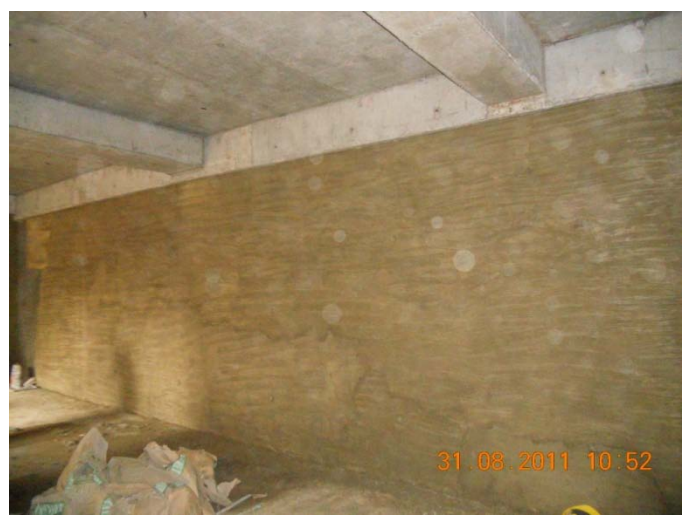
re-bar , formwork checking before casting of last portion of basemen Wall @ grid line 10A-10C