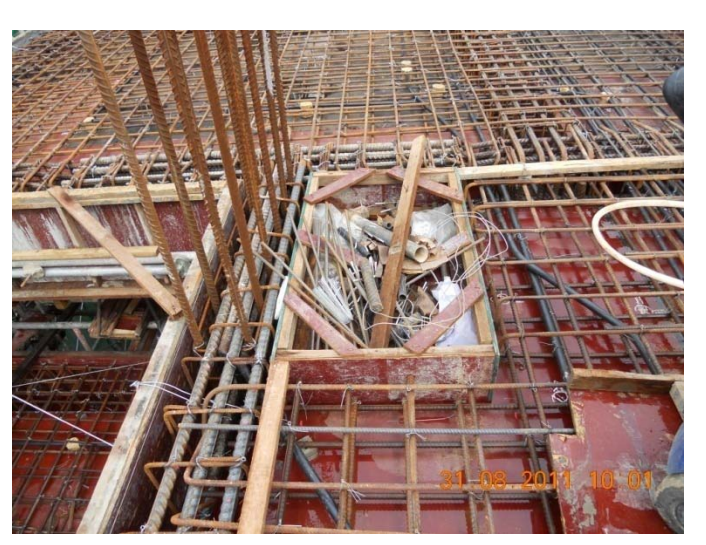
re-bar , formwork checking before casting of last portion of Grid Line 1A-6A 2^{\text{nd}} storey slab